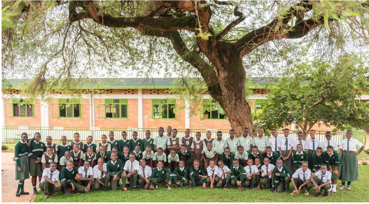
Members of the original 97 students

All glory to God for His blessing and provision for this amazing ministry in Rwanda. Education is the key to breaking the cycle of poverty, and the families of Murindi are looking ahead to the day when their children will be self-sufficient as well as provide a positive, Christian impact on the country of Rwanda.